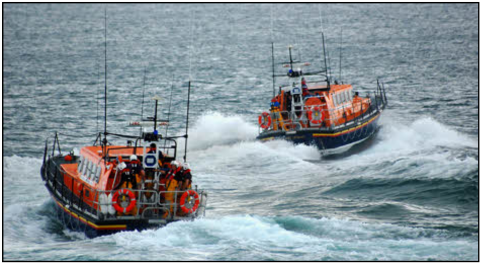
THE RARE sight of two RNLI Mersey Class lifeboats in St Ives bay. Pictured are the St Ives lifeboat The Princess Royal and the relief lifeboat Peggy and Alex Caird during the changeover.

"We have received some enquiries already but of course some licensees may want to wait to see how England get on before submitting a Notice but the message is, don't delay for too long. The quarter finals are due to take place on Saturday 8 October from 6.00 a.m. and any TEN's submisat least ten clear working days sion will need to be with us by no notice to the licensing authority later than 23 September.'